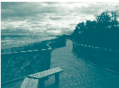
Frankston Foreshore raised timber boardwalk