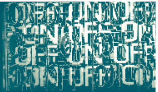
Ian de Gruchy