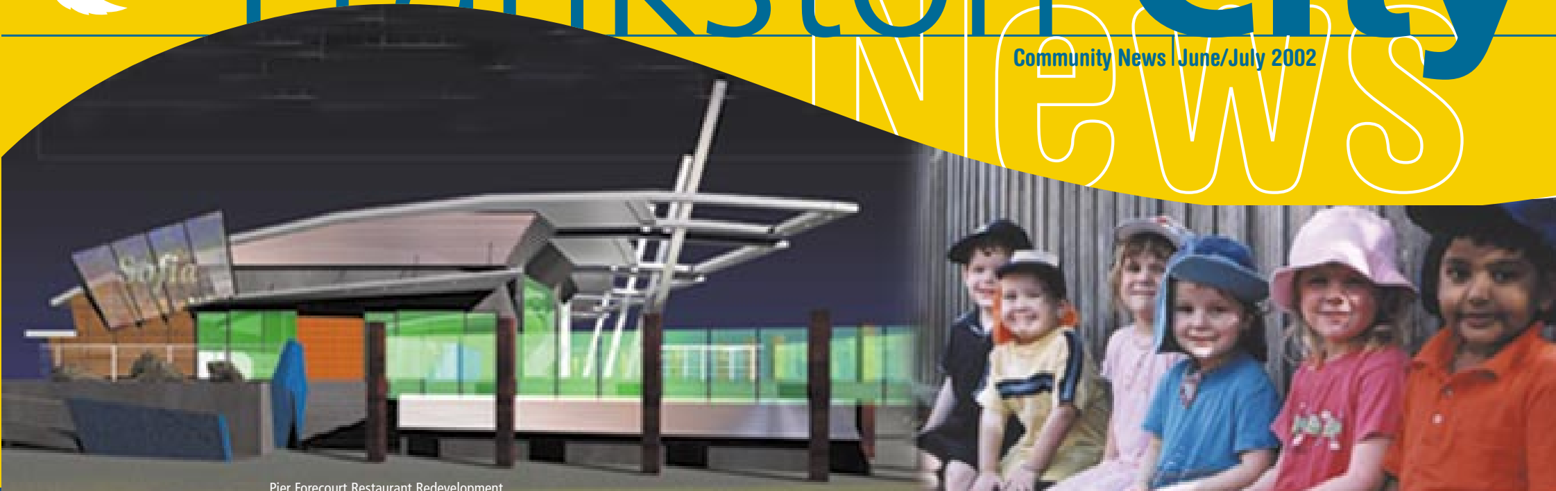
Pier Forecourt Restaurant Redevelopment