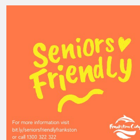
Page 9 Seniors friendly small business