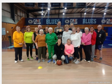
Page 7 Walking Basketball