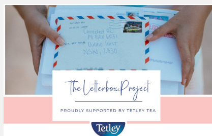
Page 6 The Letterbox Project