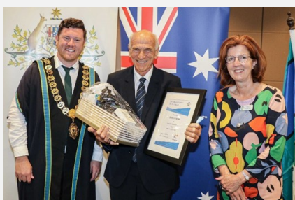
Page 5 Seniors of the Year