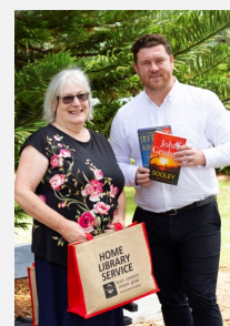
Page 9 Home library service