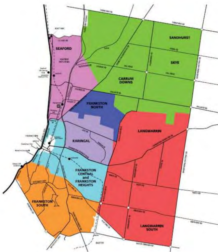
Image: 1 Map of Frankston City showing suburb boundaries

Frankston Central is one of nine nominated Metropolitan Activity Centers v , offering the outer southern Melbourne region major health, education, arts and retail precincts making Frankston City it a desirable place to work and live.