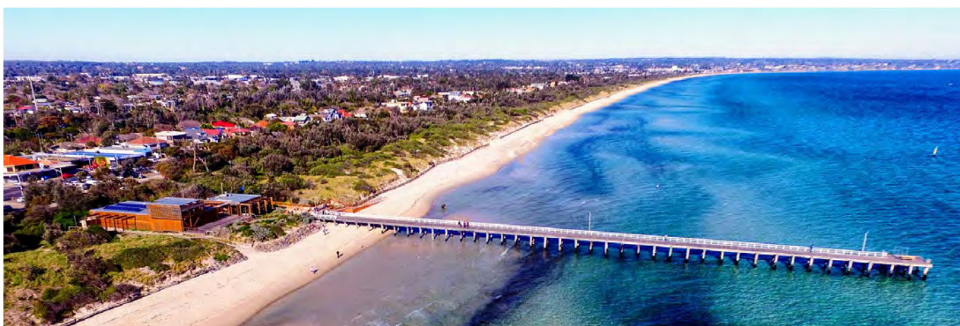
Photo: Seaford Pier and foreshore