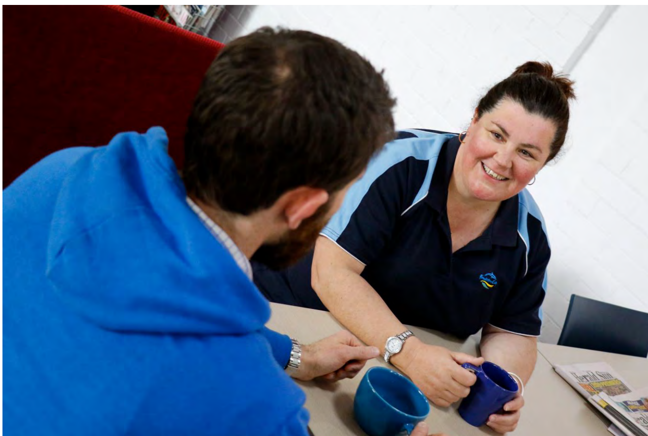
Photo: A Frankston City Council Direct Care Worker is sitting at a table having coffee with a community member.