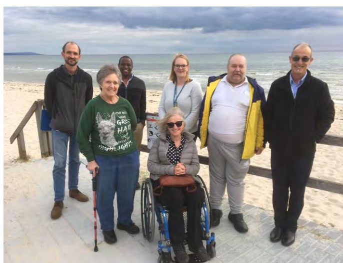
Photo: Some members of the Disability Access and Inclusion Committee at Keast Park Seaford working with Council staff to improve the accessibility of boardwalks in Seaford.