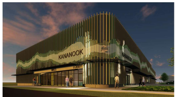
Concept design of the new building