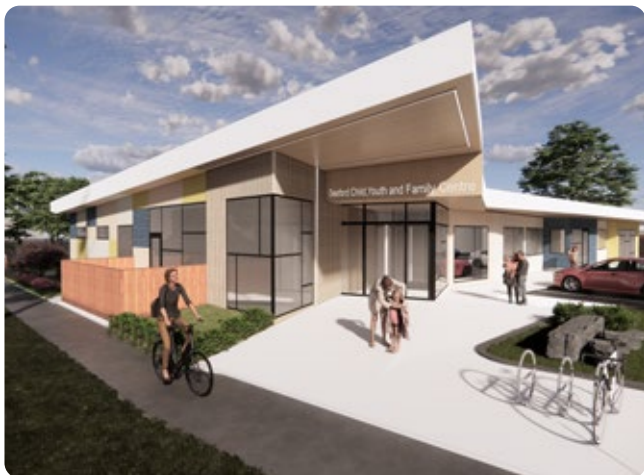
Concepts of the Seaford Child, Youth and Family Centre

designed to meet the modern needs of kindergarten and early years services. In addition to new kindergarten rooms, the facilities have been planned to accommodate a range of community services tailored to the local area, such as maternal and child health services, immunisation programs, youth