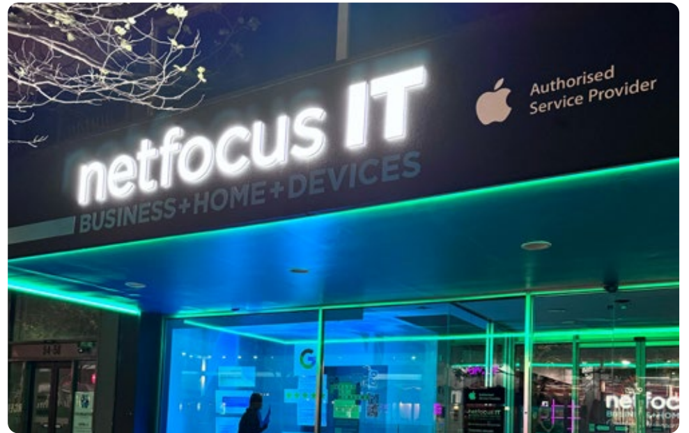
Facade Improvement Grant recipients Netfocus IT

Among the recipients is a new craft distillery Stache House focusing on quality liqueur now coming to Carrum Downs, popular modern-Asian restaurant Bang Bang will receive funding and support to find a location in Frankston plus projects including archery technology for clients with physical impairments, a 3D foot scanner, signage for a plumber, a co-working space, a tiny-home display and even more exciting and innovative initiatives thanks to the grants program which is designed to give businesses the boost they need to blossom further. To see the full list of recipients visit frankston.vic.gov.au/businessgrants . Congratulations to all grant recipients and we look forward to seeing the continued success and expansion of these businesses in our city.