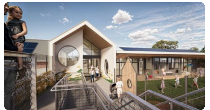
Concepts of the Langwarrin Community Centre and Early Years Project

More information available at frankston.vic.gov.au/kinder