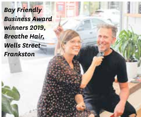
Bay Friendly Business Award winners 2019, Breathe Hair, Wells Street Frankston