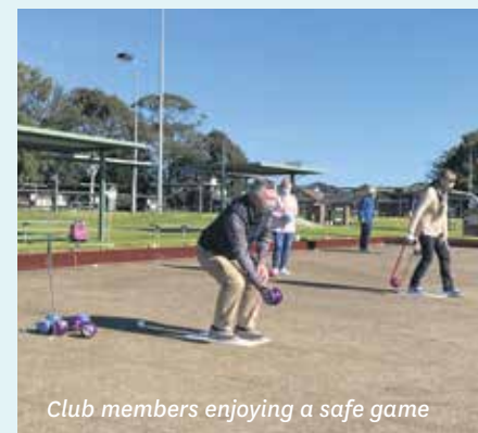
Club members enjoying a safe game