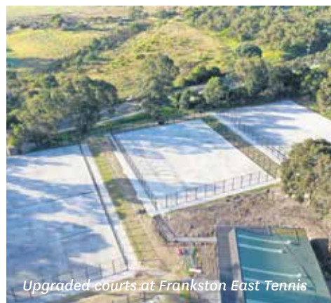
Upgraded courts at Frankston East Tennis

For more information and project updates, visit: frankston.vic.gov.au/CentenaryPark