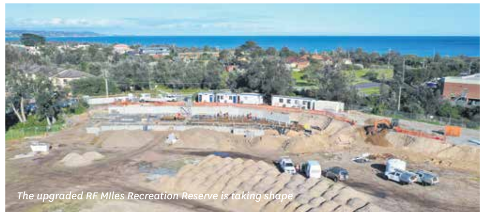
The upgraded RF Miles Recreation Reserve is taking shape

For more information and project updates, visit: frankston.vic.gov.au/RFMilesRedevelopment