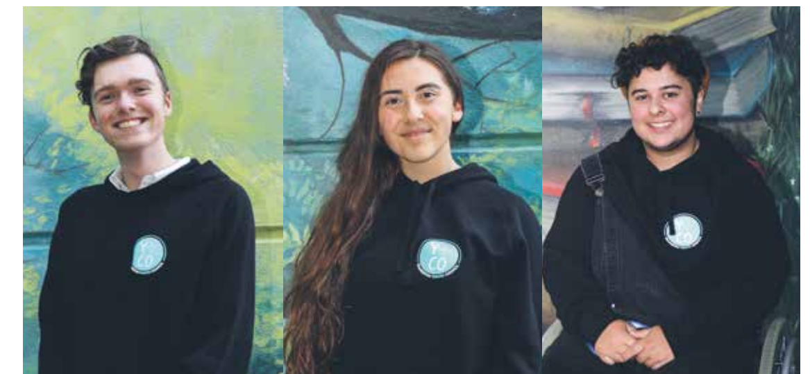
Youth Council 2022, Jorden